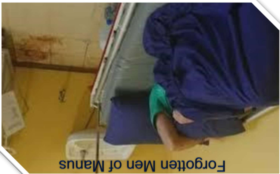
TYPHOID OUTBREAK: MANUS ISLAND - APRIL 2019